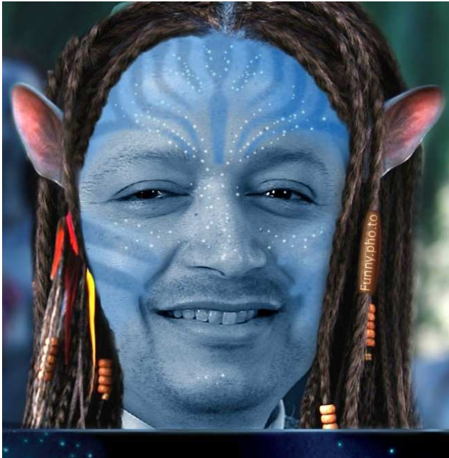
ASPEtar - In IMAX 3D