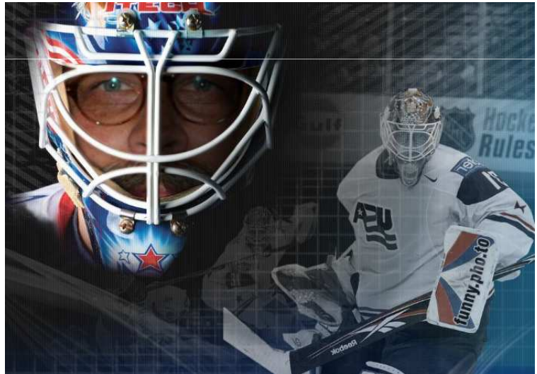
Making Saves with his knowledge of codes